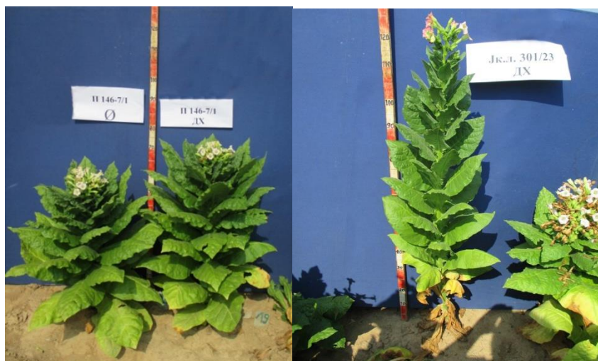
Figure 1. P 146-7/1 Ø and P 146-7/1 DH Figure 2. Jk.l. 301/23 Ø

The analyses of the physical properties were performed in the accredited laboratory of the Scientific Tobacco Institute, in accordance with the standard MKS EN ISO/IEC 17025: 2006, pursuant to recognized standard methods. The following physical properties were examined: materiality, thickness, and content of the main (mid) rib of the leaves.