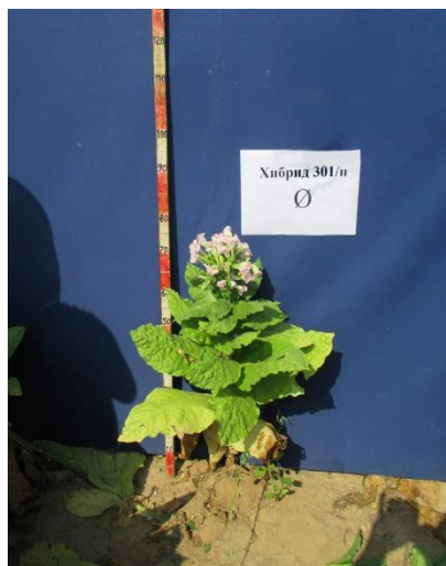
Figure 4.Хибрид 301/п Ø