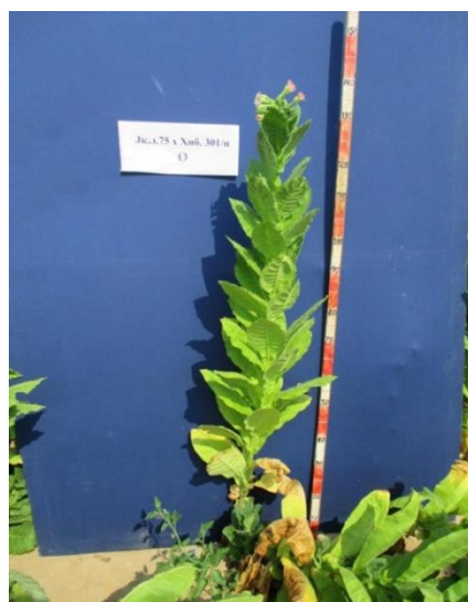
Figure 6.Жк.л.75-301 Ø