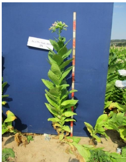
Figure 7.Jk.1.75-301 DH