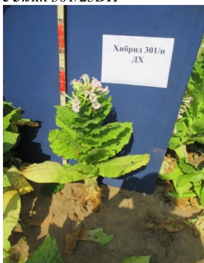
Figure 5.Хибрид 301/п DH