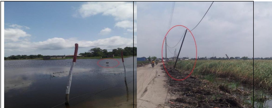
Photo 1: Electricity pole disturbed due to the exploitation of sand at Dèkounbé